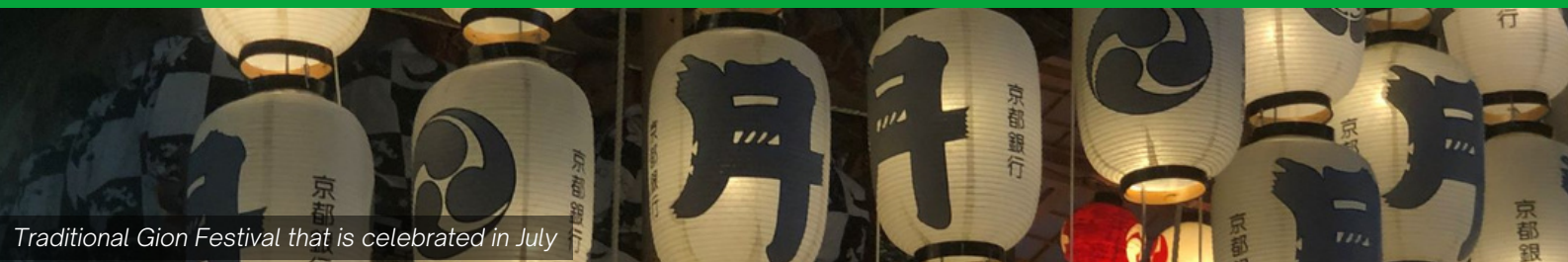
Traditional Gion Festival that is celebrated in July