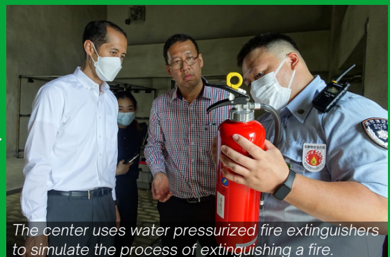
The center uses water pressurized fire extinguishers to simulate the process of extinguishing a fire.