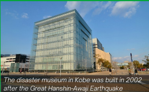
The disaster museum in Kobe was built in 2002 after the Great Hanshin-Awaji Earthquake

The Kobe Disaster Museum also had many different exhibits. It included a 7-minute film, a life-sized street view of Kobe after the earthquake, a multi-section history overview of the disaster, and finally a disaster protection workshop and game room. The purpose is to show what happened, why it happened, and how it can be prevented from happening again.