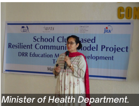
Minister of Health Department.