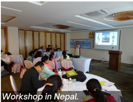
Workshop in Nepal.

CityNet-PlusArts is proud to have held a strong partnership with The University of Victoria for several years, leading to the successful integration of interns who assist in the daily operations.